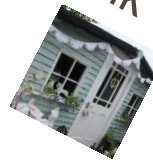
Our Shed Dearne